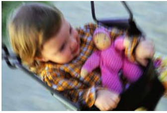
Children go through many stages...