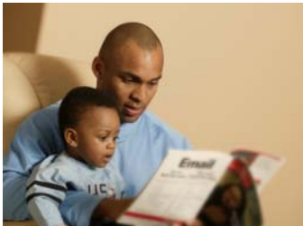
But they always need their parent's attention and love,