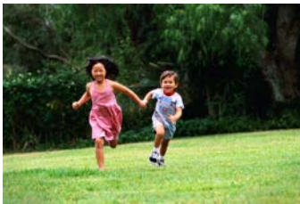
...and the freedom to play and explore.