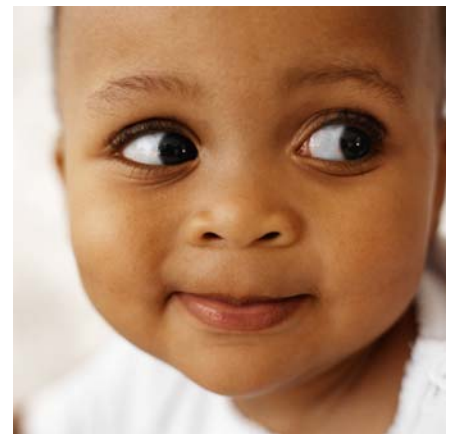
The future is as strong as her childhood is stable.