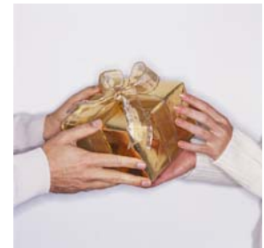
Holiday traditions, special meals, and gifts build a sense of community.